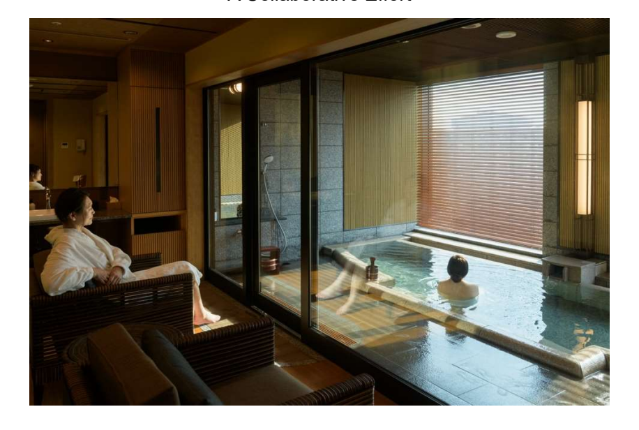
A Collaborative Effort

ReLabo Medical Spa and Stay aims to redefine wellness tourism by integrating the latest advancements in Western and Eastern medicine with state-of-the-art testing equipment, Wellness Counseling, Onsen Healing, Wellness Spa Ayurveda, Shirodhara, YogaFit, bedtime and wake-up yoga, Hot Springs, Wellness Gastronomy dietary plans, supplements, and more. Our mission is to assist guests in rediscovering their true selves and enhancing their lifestyles by encouraging a deeper understanding of health and identity.