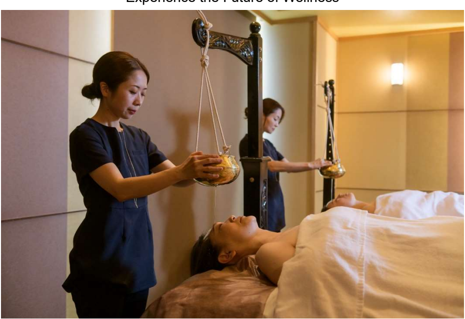
Experience the Future of Wellness

ReLabo Medical Spa and Stay is a collaborative effort involving the JR East Group, renowned tourism experts, top chefs, talented Japanese artists, and top medical professionals dedicated to serious wellness. This multidisciplinary approach ensures that every aspect of the guest's experience is meticulously crafted to promote well-being and enjoyment.